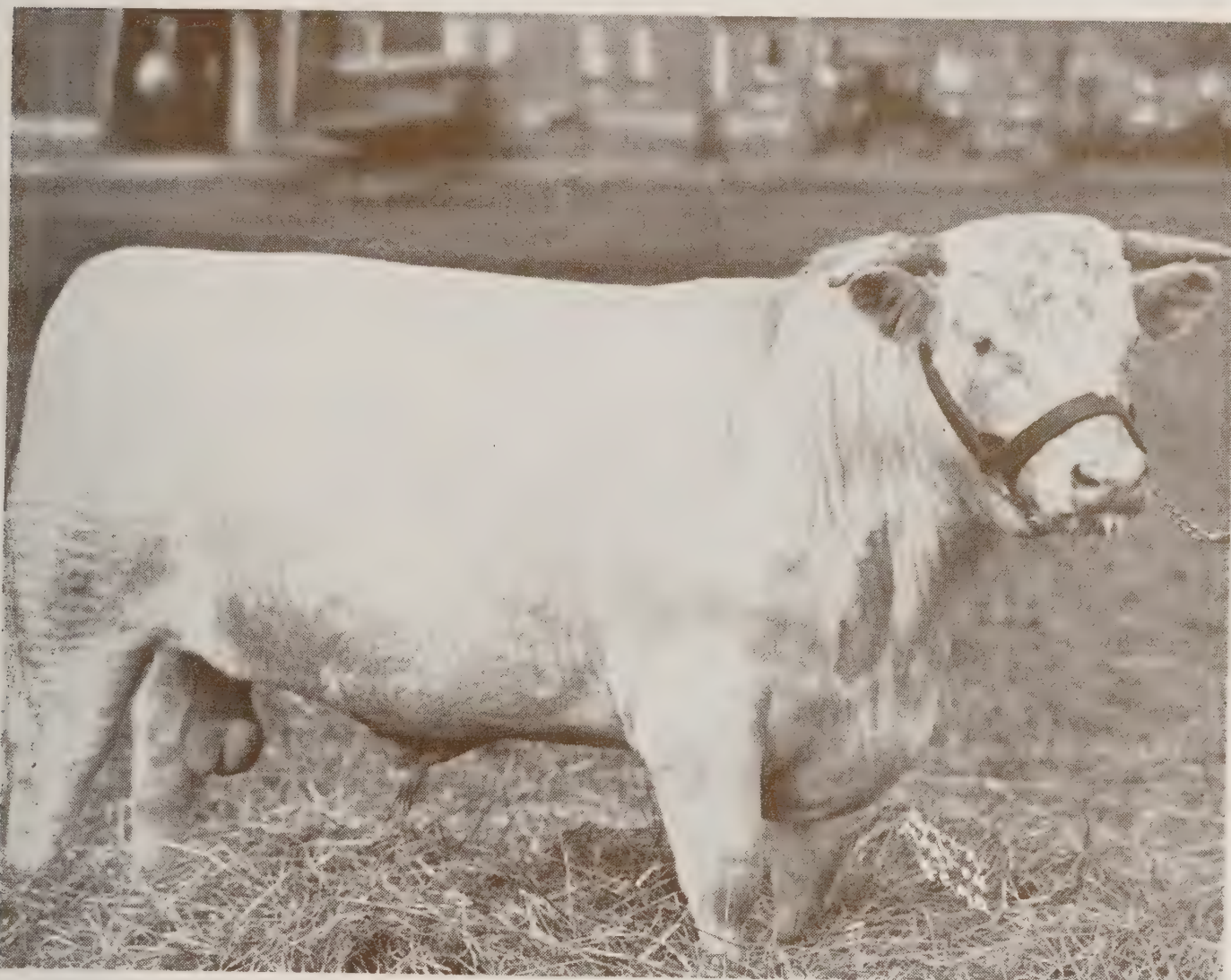
Supreme Archer by Village Supreme. First prize Junior Yearling bull at Missouri State Fair. Recently sold to head the celebrated Sni-A-Bar herd.